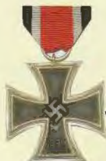
Iron Cross, 2nd Class. Germany, 1939.