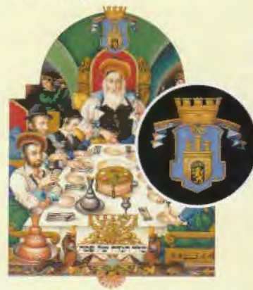
4b The Family at the Seder. The Haggadah. Łódź, 1936.