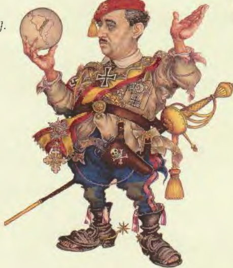
Figure 17 Hispanidad [Franco]. New York, 1943.

In “Wagner,” Death wears a World War I German uniform with Kaiser Wilhelm II’s monogram on the epaulets (see magnified detail below). The vulture, Szyk’s recurrent symbol for the German air force, always wears a Second Reich crown; e.g. in the frontispiece of Ink & Blood , a vulture with the German air force emblem on its wings is pierced by arrows bearing the emblems of the British, Russian and American air forces. (Figure 19)