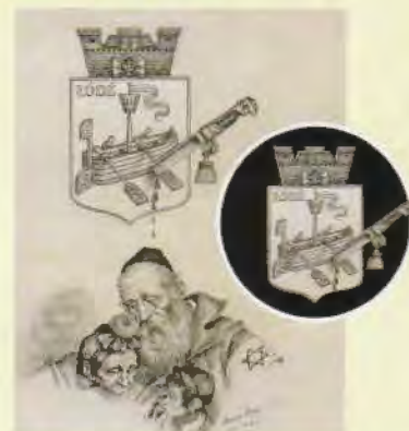
4a Lodz'sher Yizkor-Bukh. New York, 1943.