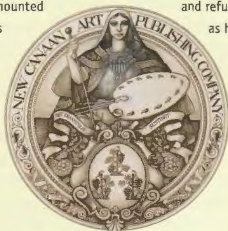
Figure 5 New Canaan Art Publishing Company Medallion. New Canaan, nd.

Although not all the paintings of the Visual History of Nations are primarily heraldic, some are. The “Visual History of Canada” (Figure 3) depicts the arms of Canada and its provinces within an elaborate border featuring the plant badges of the European founding peoples. The English rose, Scottish thistle, Irish shamrock and French lily share space with the Canadian maple leaf. Like the French fighters mentioned above, two figures flank a coat of arms: an Indian and a Canadian mounted policeman stand alongside the prewar arms of Québec. The Polish, Swiss and British paintings likewise show heraldic work of the highest order. Although the other countries in the series lack significant heraldic traditions, Szyk nevertheless made prominent use of their national symbols.