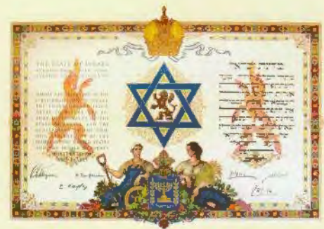
Figure 8 State of Israel Bond Certificate. New Canaan, 1950.

The Lion of Judah is also a symbol of Jewish sovereignty, traditionally seen on menorahs and Torah shields. Szyk used it often in a Jewish context, for example in "Israel Bonds" (Figure 8).