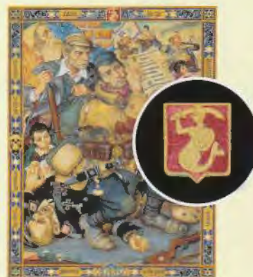
4c Samson in the Ghetto. New York, 1945.