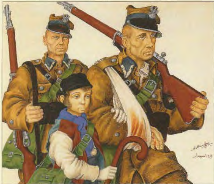
Figure 13 Retreat, 1939. London, 1939.

Like heraldic design elements, military uniforms, insignia and decorations are precise and unambiguous non-verbal graphic indicators of specific factual, historical, military and political circumstances. Szyk had a keen eye for these elements. The portrait of General Sikorski, mentioned above, is a good example among many others—see for example Szyk’s “Retreat” (Figure 13).