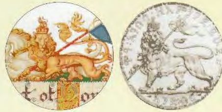
Figure 7 Silver birr of Emperor Menelik II, Ethiopia, 1900.

The armorial pages in the Visual History of Nations series are unusual in Szyk's work in that the compositions are primarily heraldic. Much more often Szyk used heraldic details to add support and elaboration to his main subjects. An excellent example is the "Dedication Page to King George VI" (Figure 6), dated 1936, which he painted for The Haggadah . The British royal arms appear in their traditional form in the lower left portion of the main panel. At their center is a quartered shield representing the nations of the United Kingdom: England, Scotland and Ireland. Above the shield is the crest of England: the English crown with a crowned lion standing across it. On either side are supporters: the lion of England, wearing the same crown, and the unicorn of Scotland, with a coronet in distinctively British form around its neck. (The alternation of crosses and fleurs-de-lys in a crown or coronet marks it as British; compare the crown on the head of the Polish eagle at bottom right). In addition to representing England and Scotland, the golden lion and silver unicorn are solar and lunar symbols, corresponding to day and night, male and female, active and passive, yang and yin ; shown together they represent dominion over opposites, or universal dominion.