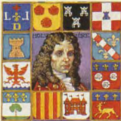
Detail. Molière encircled by city arms

The page for France ( Figure 2 ), for example, is a tour de force of heraldic art. It presents a brilliant mosaic of 90 panels, each showing the arms of one of the chief towns of France. These correspond, although not exactly, to the prefectures of the départements (administrative divisions) of the country. They are arranged in rows and columns only one panel wide, forming borders around other pictorial elements such as portraits of French heroes. On the left-hand side, for example, is a portrait of Molière, the 17th century playwright. Around it, reading clockwise from upper left, are the arms of the cities of Digne-les-Bains, Grenoble, Tours, Chambéry, Évreux, Chartres, Quimper, Châteauroux, Foix, Privas, Nice and Bastia.