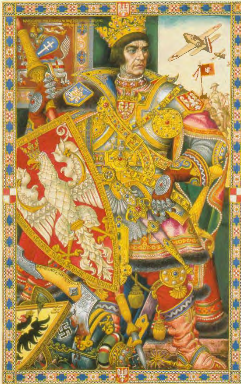
Figure 10 Jagiello, King of Poland. New York, 1942.

But great artists do not necessarily need their viewers to understand how they achieve their effects. It is sufficient that Szyk created a heraldic image of great power and presence, to complement the same attributes in the king who is the main subject of the work. Never mind, for most viewers, how he did it. Few will be consciously aware of the echo and support this eagle lends to the portrait of the king, but the effect is there even if its means are invisible to most viewers. And noticing even some of it helps us better understand Szyk's art.