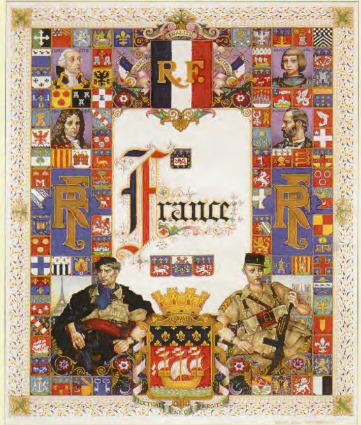
Figure 2 Visual History of France. New Canaan, 1947.

the chief of France in the large arms of Paris at the base of the composition. But Szyk omits Tours' chief of France, showing only the lower section of the shield (three white towers on black). He might have simplified the arms because of the restricted space; or perhaps he was avoiding too many repetitions of the same motif. Whatever his intentions, these variations were certainly deliberate choices by this careful artist, rather than errors.