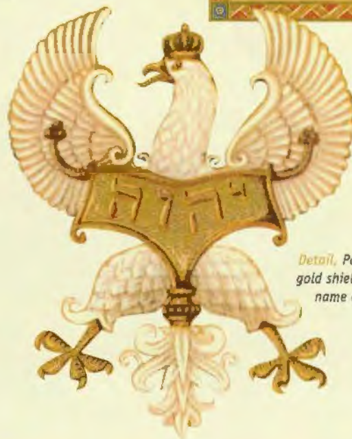
Detail, Polish eagle with gold shield bearing the name of God