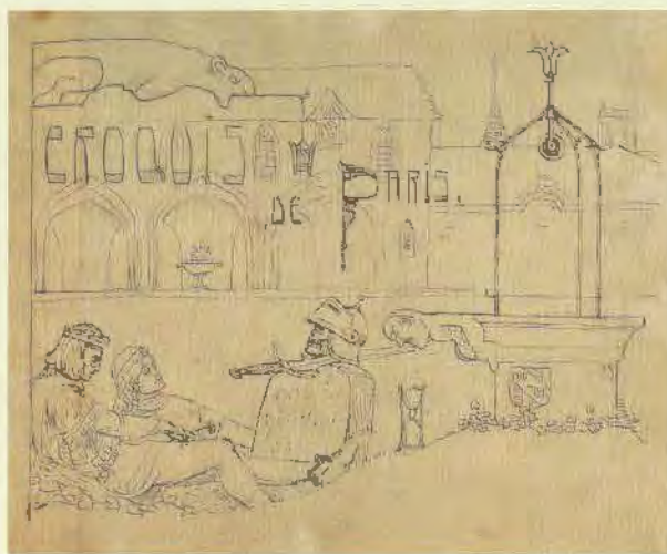
Figure 1 Croquis de Paris (recto) . Paris, 1911.

Szyk trained as an artist at the Académie Julian in Paris, where teachers encouraged students to study and copy at the Louvre. Heraldry had been an important element of decorative art in every province of western and central Europe for centuries, so he would certainly have found many examples to learn from at the Louvre and elsewhere.