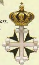
Order of SS. Maurice and Lazarus, Commandeur. Italy, before 1946.