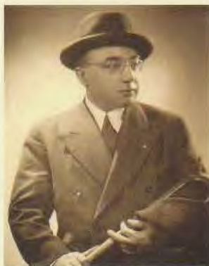
Arthur Szyk. Paris, circa 1930s.

Almost sixty years after his death in 1951, Arthur Szyk's fame as an artist rests principally on his anti-Nazi polemical art of the 1930s and 1940s, and on his vivid compositions on Polish, Jewish and American patriotic themes. Those more familiar with his work think also of his masterpiece, the famous Haggadah, and of his paintings in the Art Deco and Bezael styles, his cartoons and illustrations and advertising, and his modern adaptation of the techniques of medieval and Renaissance illumination.