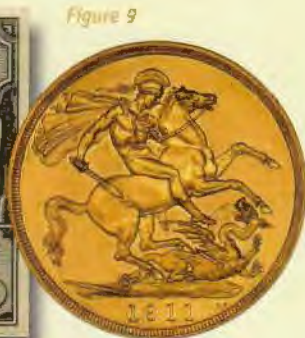
Figure 9 Double sovereign (verso). Great Britain, 1911. Design by Benedetto Pistrucci.

At the top of the composition the unicorn, still with its coronet and chain, menaces a dragon. Its horn, pointed toward the dragon’s mouth, echoes the dragon-killer image below. At the bottom right is the white eagle of Poland— Orzeł Biały —identified by the red background, golden crown, and distinctive golden accents on its wings and tail. This eagle has been the emblem of the Polish nation since medieval times; it was already a well-established symbol in 1320 when it appeared with all these attributes on the Polish coronation sword Szczerbiec . Next to the eagle, Szyk shows himself leaning against the composition. 1