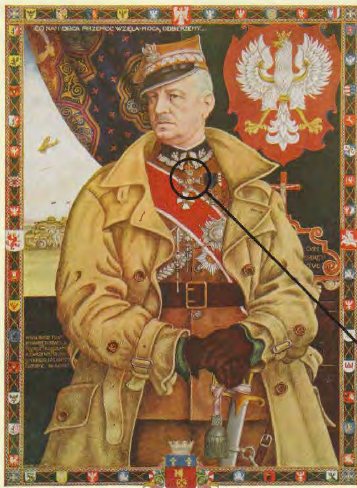
Figure 11 General Władysław Sikorski. Np, nd.

Szyk's portrait of his friend General Władysław Sikorski (1881–1943), prime minister and military commander of the Polish government in exile (Figure 11), shows again how much depth of meaning Szyk is able to evoke with heraldic design elements. It is bordered with the arms of the ancient provinces and districts of Poland. This motif, found on the seals of medieval Polish kings, denotes national authority; a 16th century woodcut of the Polish king meeting his Senate (Figure 12) shows many of the same arms. In the upper right of the portrait is another Polish eagle.