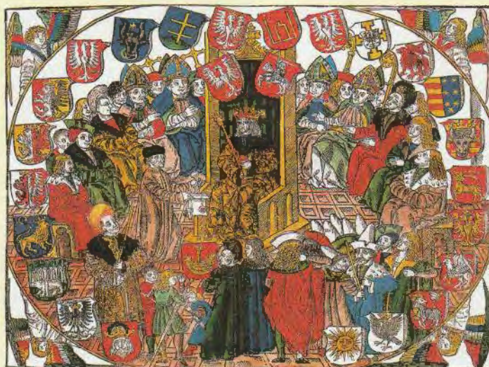
Figure 12 Frontispiece, Statuty Laskiego. Krakow, 1506. Colored woodcut.

At the bottom center are the arms of the French city of Angers, the seat of Sikorski's government before it withdrew to London in 1940. On the curtain in the upper corner of the composition Szyk has included an arm holding a scimitar, a traditional emblem of Polish military power found on flags as far back as the 17th century and still used on the modern Polish naval jack. In the corners of the border note the cross of the Virtuti Militari , also worn on Sikorski's tunic. The general received this decoration—Poland's highest military honor—for his valor against the Bolsheviks in the Battle of Warsaw (1920). Szyk served under Sikorski in the Polish army from 1919 to 1920.