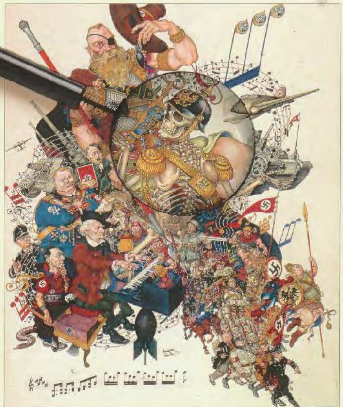
Figure 18 Wagner, Niebelungen series. New York, 1942.

Szyk used heraldic details to say something else about Germany: that the Nazi regime of the Third Reich continued the militarism characteristic of the Second Reich (1871–1918) under Bismarck and the Hohenzollern Kaisers. He made this point explicitly in paintings like “La Grande Tradition,” but also more subtly by modifying the heraldic crown of the second Reich—with swastikas and death’s heads, and placing it on the figure of Germania in paintings such as “I Need Peace Now.” In satiric drawings like “Valhalla” and “Wagner,” (Figure 18) Szyk put characters into Second Reich uniforms, including the well-known Pickelhaube spiked helmet.