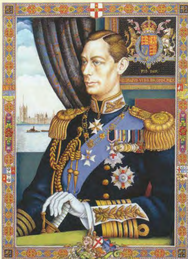
Figure 16 King George VI . London, 1938.

Szyk was not the only artist to use the Nazis' excessive uniform accessories as a point of ridicule. But he did it best, and most luxuriantly, and with the most precision. It is worth mentioning that in almost every one of Szyk's lampoon images of Axis leaders in uniform, he showed them wearing German, Italian and Japanese decorations, to emphasize that all three powers shared responsibility for the war and associated outrages.