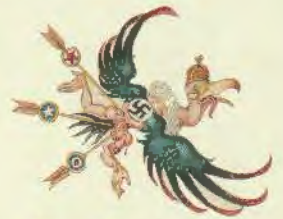
Figure 19 Ink & Blood , frontispiece

In “Wagner,” Death wears a World War I German uniform with Kaiser Wilhelm II’s monogram on the epaulets (see magnified detail below). The vulture, Szyk’s recurrent symbol for the German air force, always wears a Second Reich crown; e.g. in the frontispiece of Ink & Blood , a vulture with the German air force emblem on its wings is pierced by arrows bearing the emblems of the British, Russian and American air forces. (Figure 19)