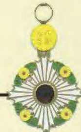
Supreme Order of the Chrysanthemum. Japan, since 1876.

Image of the Iron Cross courtesy Quintus Fabius Maximus, Wikimedia Commons. Image of the Order of SS. Maurice and Lazarus courtesy Seraphin74, Wikimedia Commons; licensed under the Creative Commons Attribution-Share Alike 2.5 Generic license ( http://creativecommons.org/licenses/by-sa/2.5/deed.en ). Image of the Supreme Order of the Chrysanthemum Medal courtesy Liverpool Medal Company Ltd ( www.liverpoolmedals.com ).