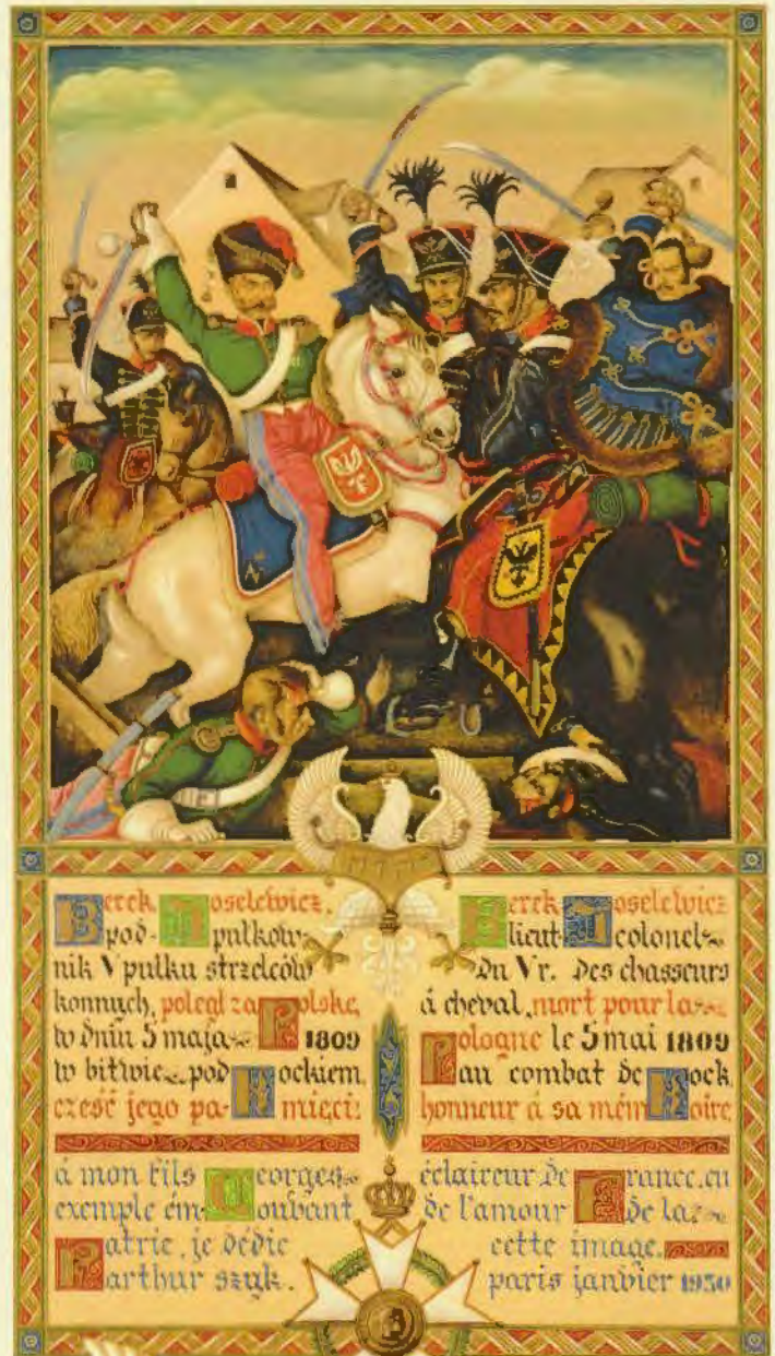
Figure 14 The Death of Berek Joselewicz, Statue of Kalisz. Paris, 1927.

This distinctive composition was, and still is, the emblem of the Polish army, used for flags, cap badges, and many other purposes. But here the shield bears the name of God in Hebrew.