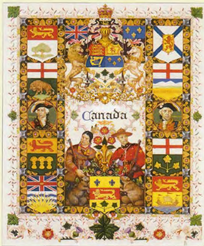
Figure 3 Visual History of Canada. New Canaan, 1946.

Although not all the paintings of the Visual History of Nations are primarily heraldic, some are. The “Visual History of Canada” (Figure 3) depicts the arms of Canada and its provinces within an elaborate border featuring the plant badges of the European founding peoples. The English rose, Scottish thistle, Irish shamrock and French lily share space with the Canadian maple leaf. Like the French fighters mentioned above, two figures flank a coat of arms: an Indian and a Canadian mounted policeman stand alongside the prewar arms of Québec. The Polish, Swiss and British paintings likewise show heraldic work of the highest order. Although the other countries in the series lack significant heraldic traditions, Szyk nevertheless made prominent use of their national symbols.