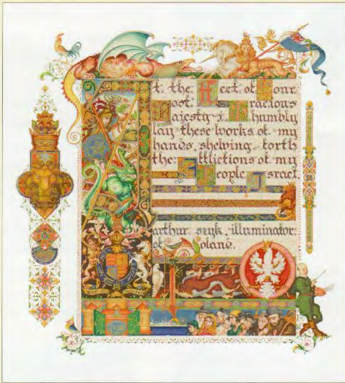
Figure 6 Dedication to King George VI, The Haggadah . Łódź, 1936.

The armorial pages in the Visual History of Nations series are unusual in Szyk's work in that the compositions are primarily heraldic. Much more often Szyk used heraldic details to add support and elaboration to his main subjects. An excellent example is the "Dedication Page to King George VI" (Figure 6), dated 1936, which he painted for The Haggadah . The British royal arms appear in their traditional form in the lower left portion of the main panel. At their center is a quartered shield representing the nations of the United Kingdom: England, Scotland and Ireland. Above the shield is the crest of England: the English crown with a crowned lion standing across it. On either side are supporters: the lion of England, wearing the same crown, and the unicorn of Scotland, with a coronet in distinctively British form around its neck. (The alternation of crosses and fleurs-de-lys in a crown or coronet marks it as British; compare the crown on the head of the Polish eagle at bottom right). In addition to representing England and Scotland, the golden lion and silver unicorn are solar and lunar symbols, corresponding to day and night, male and female, active and passive, yang and yin ; shown together they represent dominion over opposites, or universal dominion.