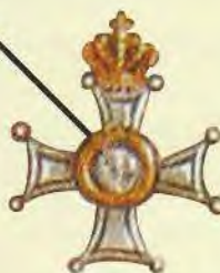
Detail. Virtuti Militari