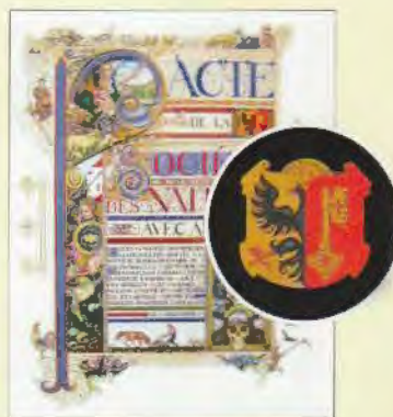
4d Pacte de la Société des Nations. Paris, 1931.