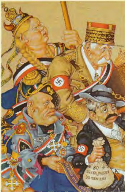
Figure 15 Satan Leads the Ball (detail). New York, 1942.

Szyk's signature use of uniform details is in his wartime caricatures, where the insignia of the Nazis and their allies are exaggerated to the point of burlesque. Szyk took care, though, to mix authentic details with fanciful ones. In "Satan Leads the Ball" (Figure 15), the military cap of Marshal Pétain, leader of the collaborationist French state, is shown with its correct braid, and the seven stars on his sleeve are his proper insignia as a Marshal of France. But Pétain's cap and epaulet have swastikas on them, and he wears a Nazi Party armband. These details are polemical rather than historically accurate. The images of Mussolini, French Prime Minister Laval, and the allegorical figure of Germania/Brunhilde get similar treatment. Swastikas and death's heads are added liberally to Axis uniforms of all kinds (the SS really did use the death's head as a cap badge). A close view of the cuff braid from Szyk's portrait of King George VI (Figure 16) shows how lush and sensuous he could make his uniform details.